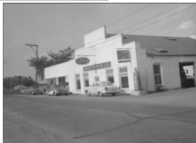
Photos: Dakota Traveling painted by Seth Eastman, Haeg family horse and wagon, Northwest Airlines passenger plane, Dan Patch Electric Railroad, Scott Ford Motors on Cedar Ave.